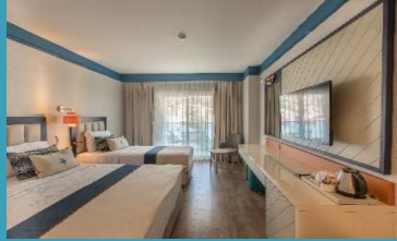
Std. Side Sea View Room