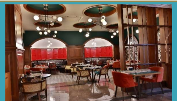
Turk A la Carte Restaurant