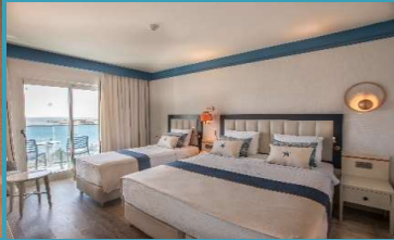
Std. Direct Sea View Room