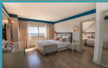
1+1 Direct Sea View Family Corner Suite