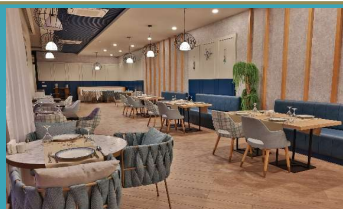
Ege A la Carte Restaurant